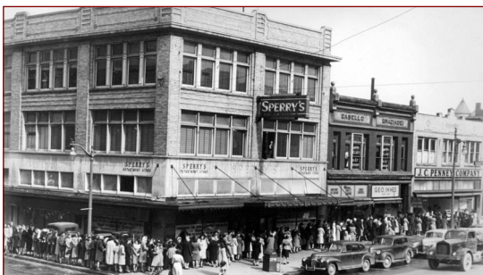
Before: Sperry Department Store